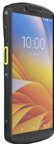
ZEBRA TC5X Series Mobile devices