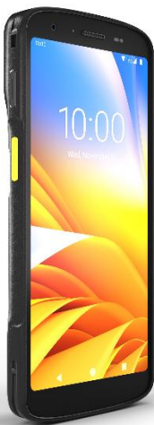
ZEBRA TC2X Series Mobile devices